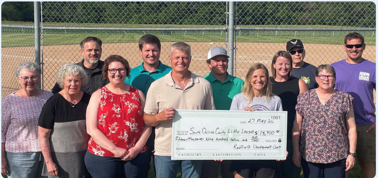
Photo caption: Redfield Development Corporation presents a $15,900 donation to South Dallas County Little League for improvements to the Redfield ball diamonds.